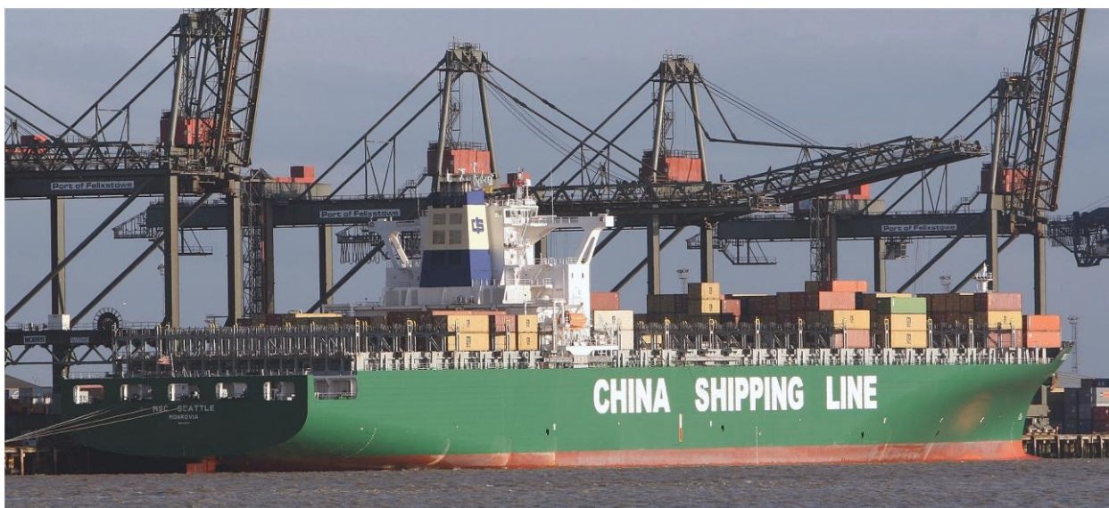
Named MSC SEATTLE (CSCL sublet to MSC from 2008-2010) Felixstowe (U.K.) 27/11/2008

2017: Demolition as HS COLUMBIA-1 (Togo-flag) at Chittagong 21/02/2017.