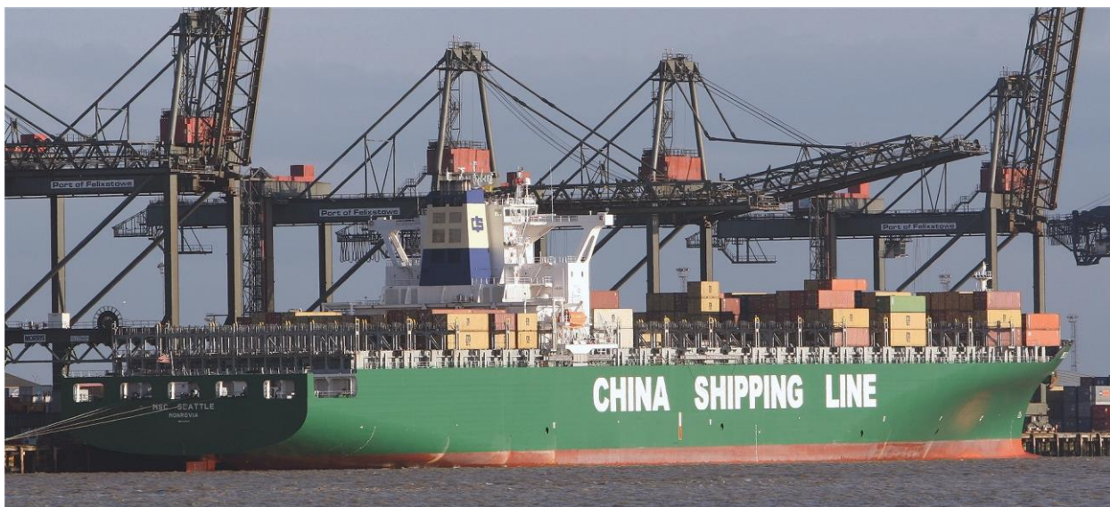
Named MSC SEATTLE (CSCL sublet to MSC from 2008-2010) Felixstowe (UK) 27/11/2008