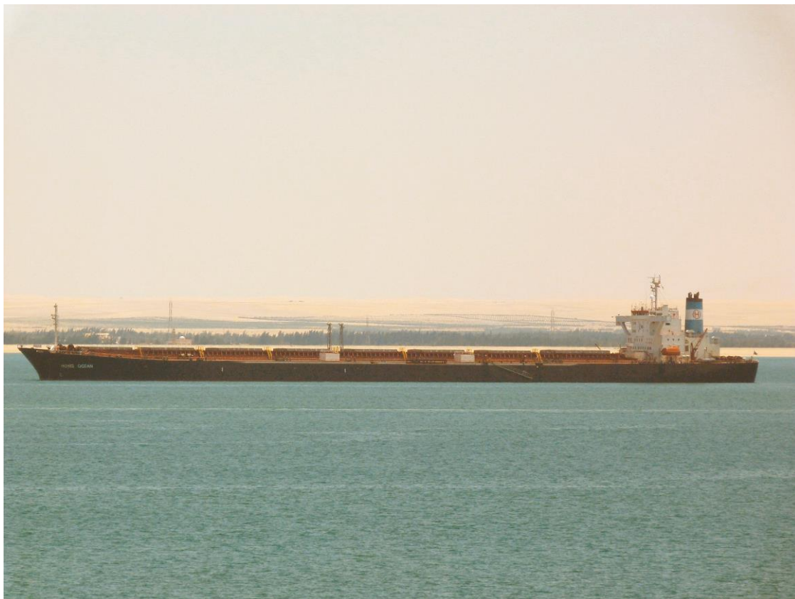
Suez Canal 7/6/2011