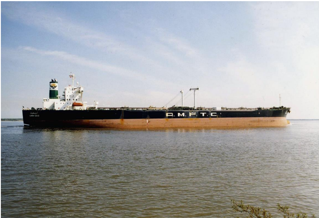
named UMM SAID (crude oil tanker) Delaware River 18/4/1998