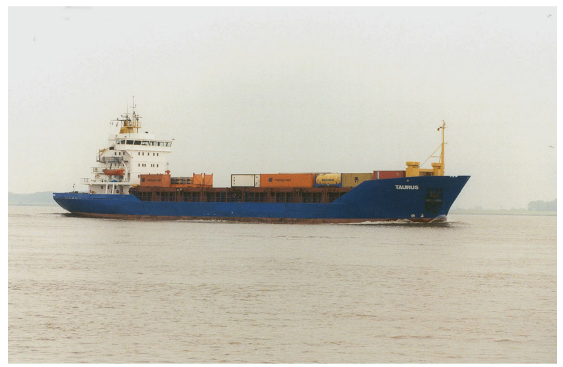
Elbe River 28/8/200