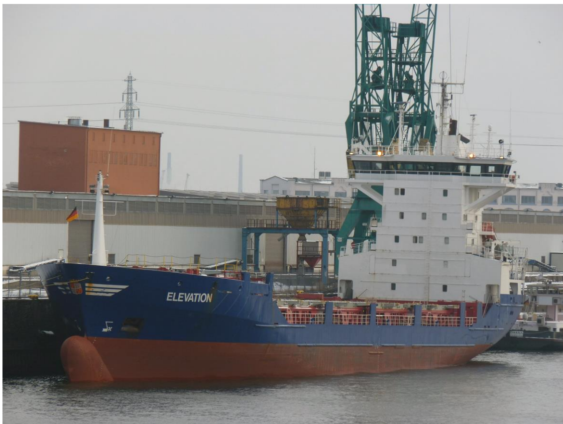
Hamburg 4/1/2010