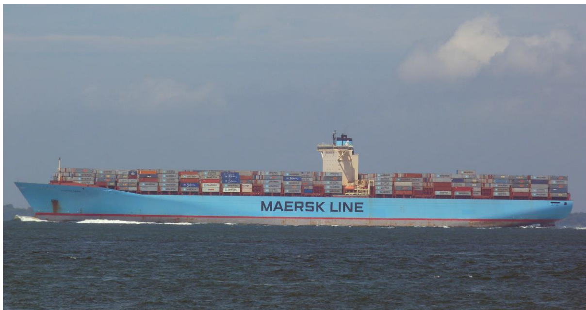
Singapore Straits 27/6/2011