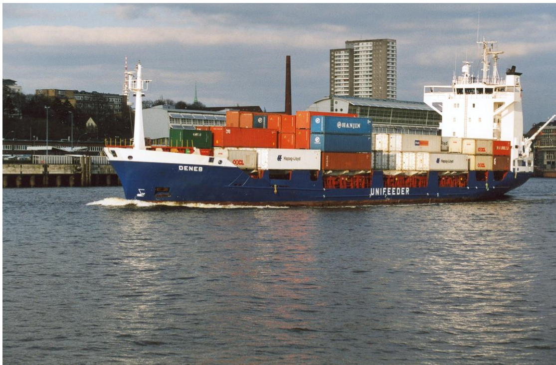
Hamburg 25/3/2002