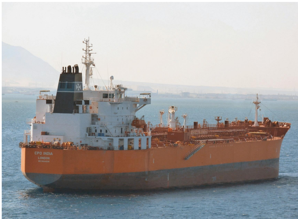
Suez Anchorage 7/6/2011

2018-12: Sold to Tufton Oceanic (a British (UK) private equity company). Renamed SVEN (2019-01).