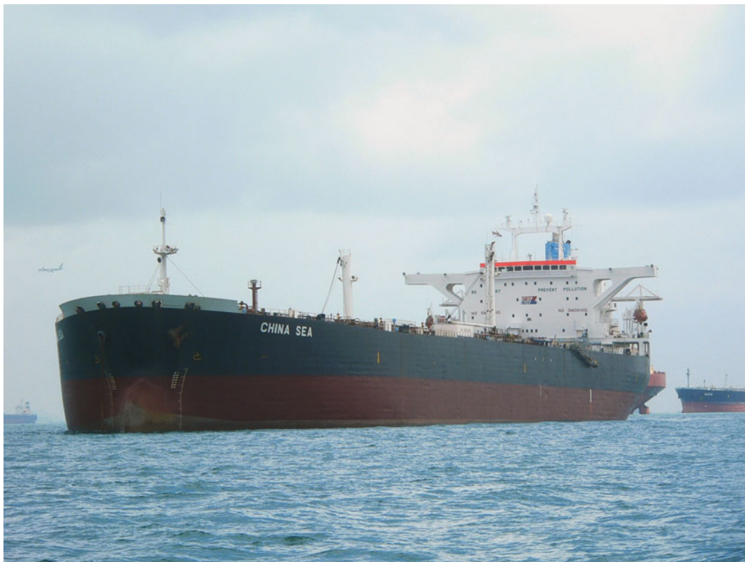
Singapore 15/1/2007