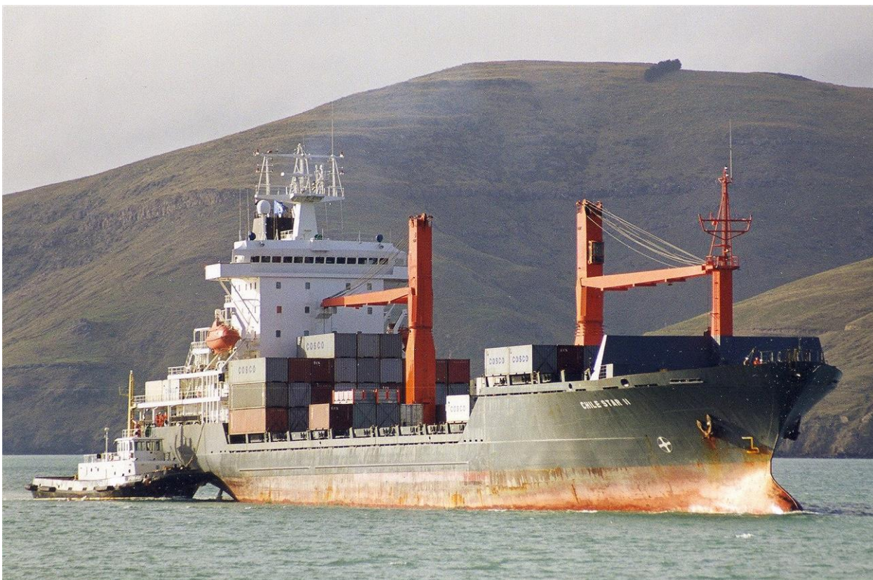
Lyttelton (N.Z.) 25/6/1999

1998: Renamed CHILE STAR II (new charter name / previous charter expired).