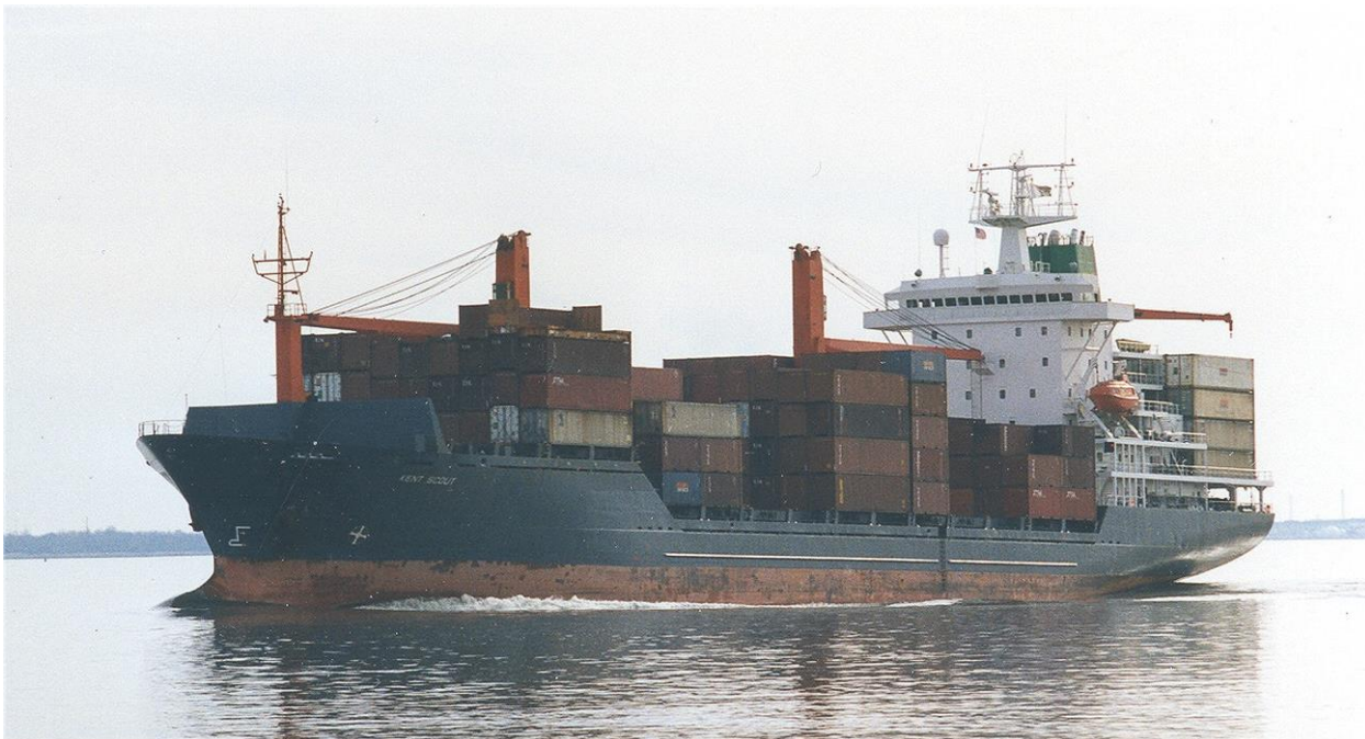
Named KENT SCOUT Delaware River 2/2/1998

1997: Renamed KENT SCOUT (charter name).