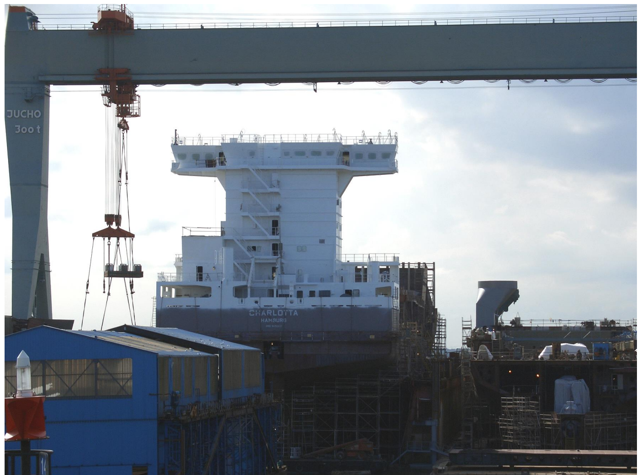
Hamburg Sietas Yard 21/8/2008