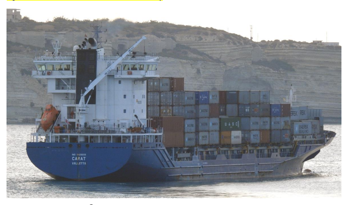
Malta Freeport 09/05/2018

Mgrs:Leonhardt & Blumberg Shipmanagement GmbH & Co KG, Germany representing a JV founded in 2017 when Leonhardt & Blumberg and Buss Shipping (both Germany) merged their ship mangement business.