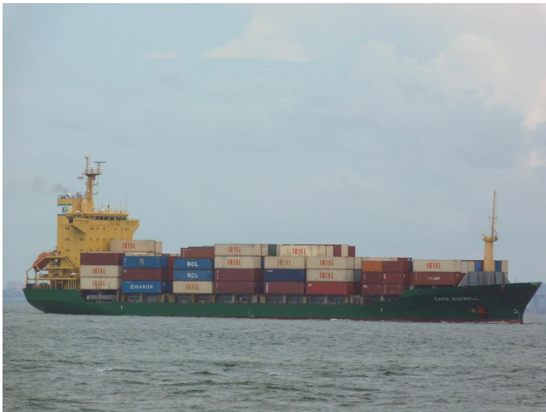
Singapore Straits 29/6/2011