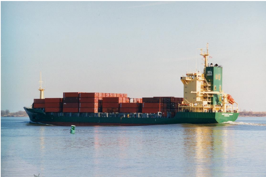
Named INDEPENDENT CONCEPT Delaware River 11/1/1998