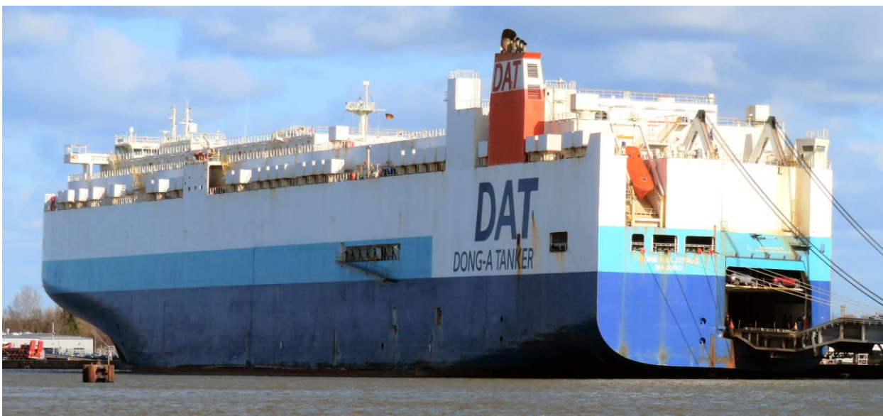
Named DONG-A GLAUCOS Bremerhaven 25/2/2023

2014: Sold to Dong-A Tanker Corp (South Korea). Renamed DONG-A GLAUCOS .