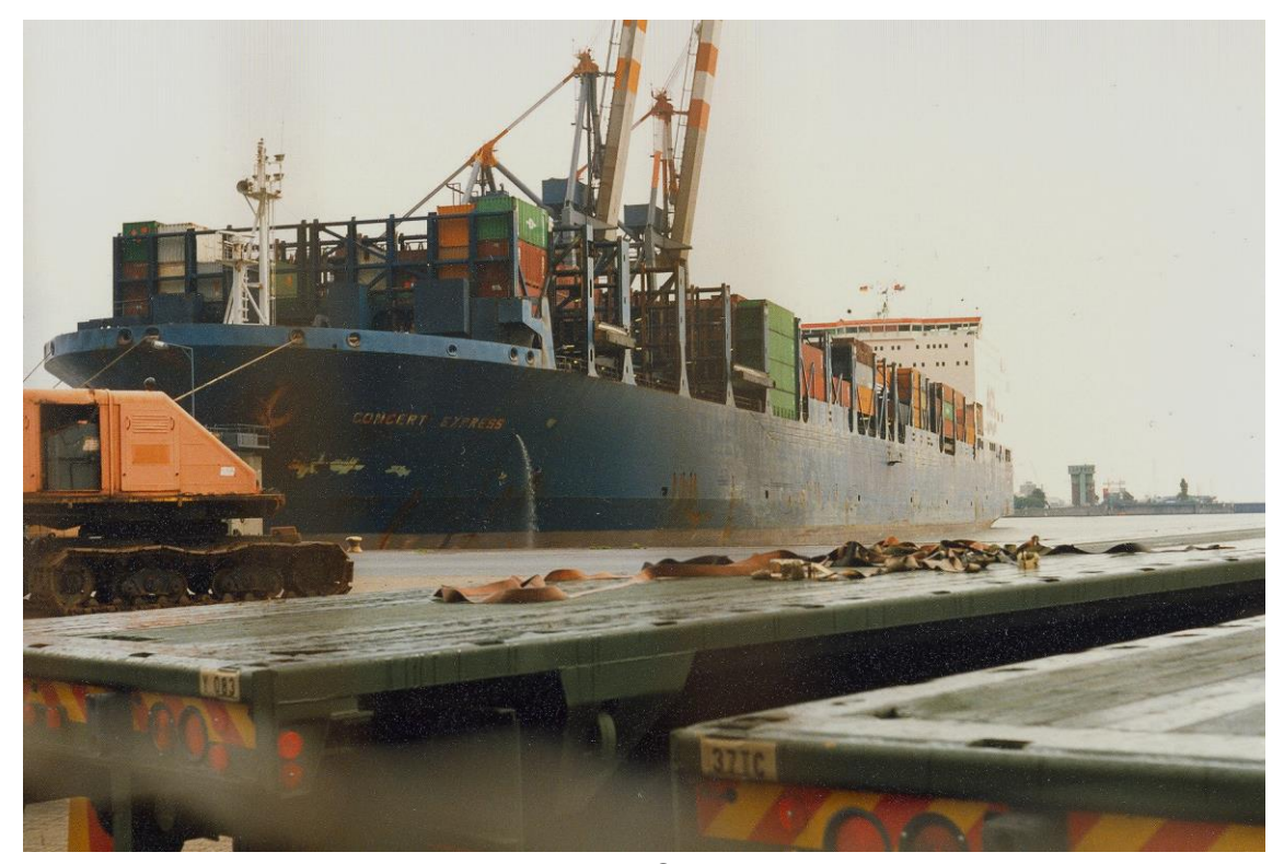
Named CONCERT EXPRESS Bremerhaven 24/7/1993