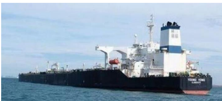
Ministry of Transportation Republic of Indonesia

Divers have repeatedly been sent to inspect the state of the hull, with local officials reporting strong currents buffeting the grounded vessel. No spill has been reported yet.